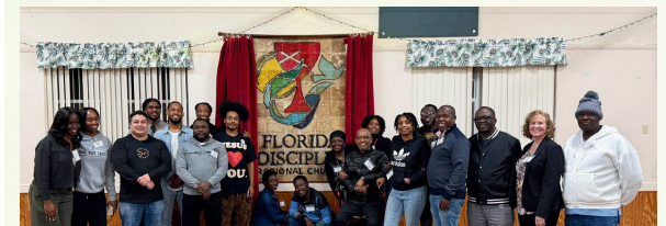
2025 Haitian Clergy and Leadership Retreat

Strengthening regional ministry ensures that every congregation has the support and resources needed to grow, innovate, and faithfully serve their communities.